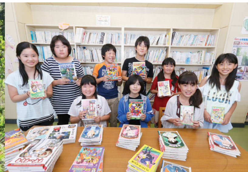
NU SKIN SMILE LIBRARY, JAPAN